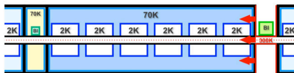
Figure 3: Schematic of hybrid cryomodule with one cold gap to the left and one warm gap to the right.

if some of the intermediate sections are left at room temperature because of requirement from, e.g., beam instrumentation. However, this hybrid scheme is mechanically more complex, and it remains to be evaluated whether its advantages outweigh the increased complexity.