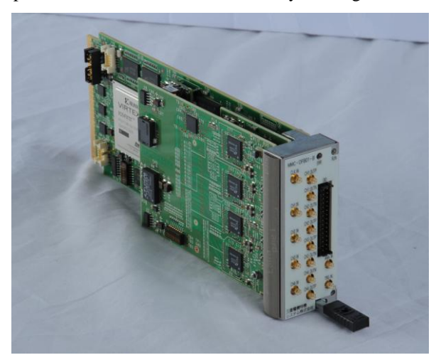
Figure 1: Virtex-5-based MicroTCA card (embedded IOC) for the digital feedback control

Traditional I/O-bus usage for IOCs has been to let the CPU board access non-intelligent I/O cards on the backplane with dedicated device/driver support modules. Another approach, however, is a viable option for MicroTCA, where Channel Access is available for the communication over Gigabit Ethernet on the backplane. By running an OS on all of the Virtex-5-based intelligent I/O cards to make themselves embedded IOCs, as shown in Figure 2, existing Channel Access library as it is can be used to let the I/O cards (IOCs) communicate each other over Gigabit Ether without any special efforts. This approach considerably reduces the cost for the implementation of software on IOC by making most out