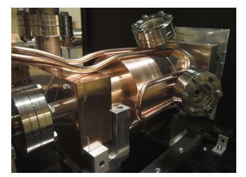
Figure 1: DAW-type cavity for the baseline RF gun.

However, in order to deliver an electron beam with required characteristics, space charge effect mitigation by a longer bunch length (30ps) and especially energy-spread