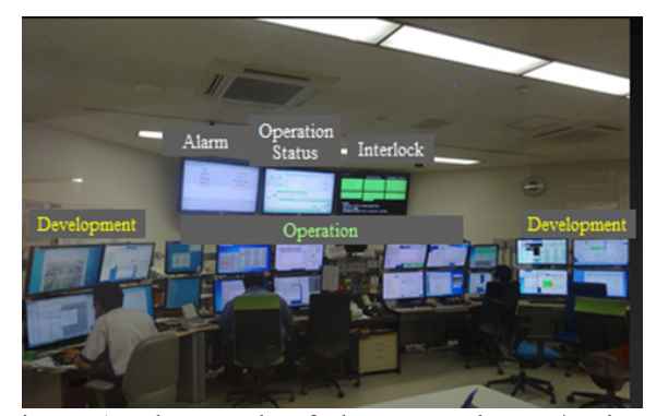
Figure 1: Photograph of the KEK electron/positron injector linac main control room.

The Tektronix X terminals and touch panel displays based on PC9801/DOS machines have been originally utilized as the operator terminals. These terminals were replaced by the Linux based PCs and Windows based PCs with the X server application software of ASTEC-X and